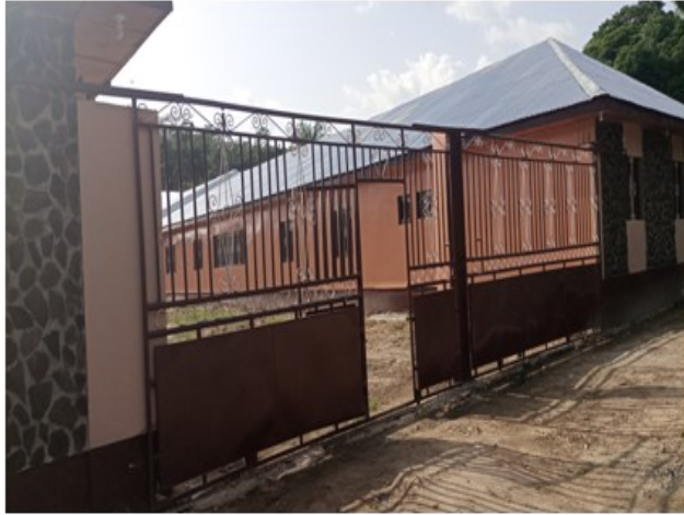
External View of Mintawon Guesthouse