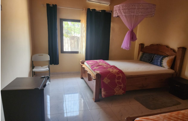
Another bedroom view