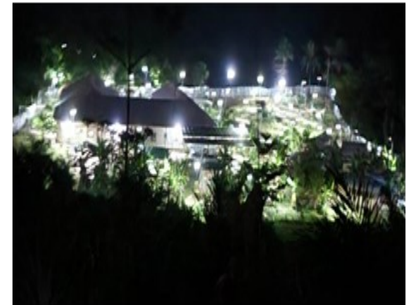
Night View of Mintawon Village