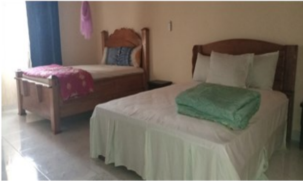
Two persons to a room